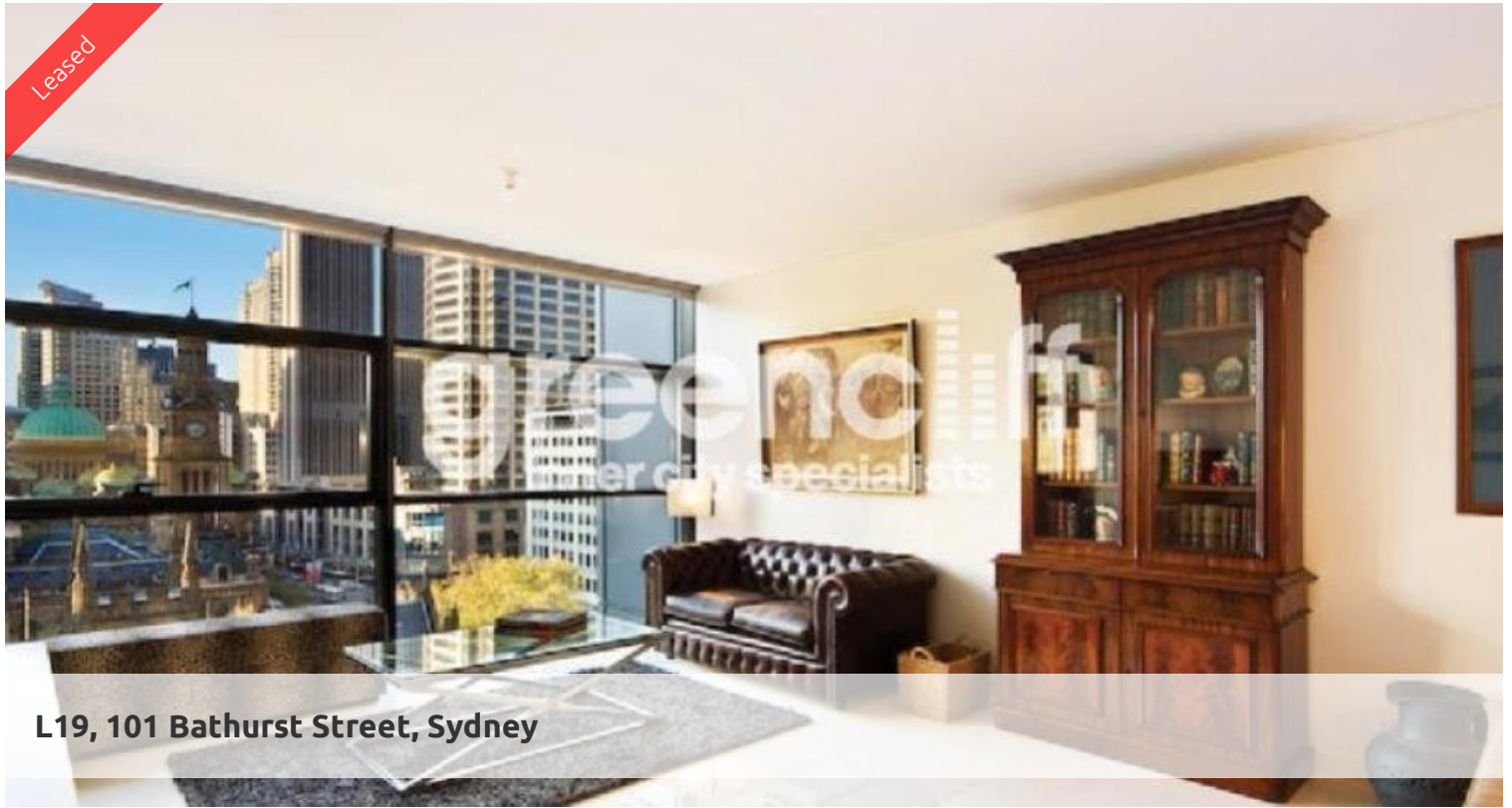
L19, 101 Bathurst Street, Sydney