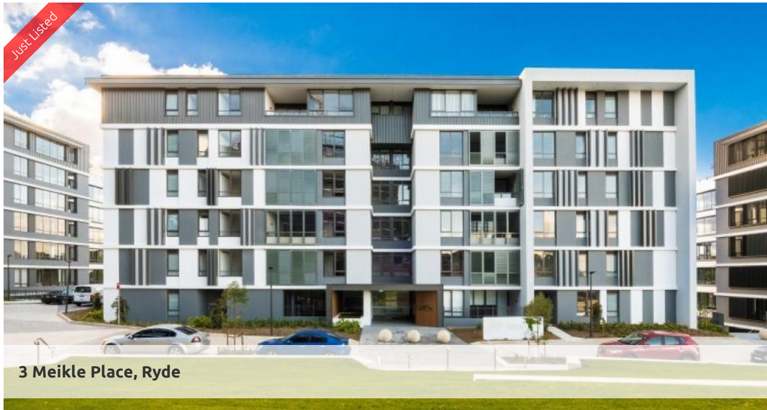
3 Meikle Place, Ryde