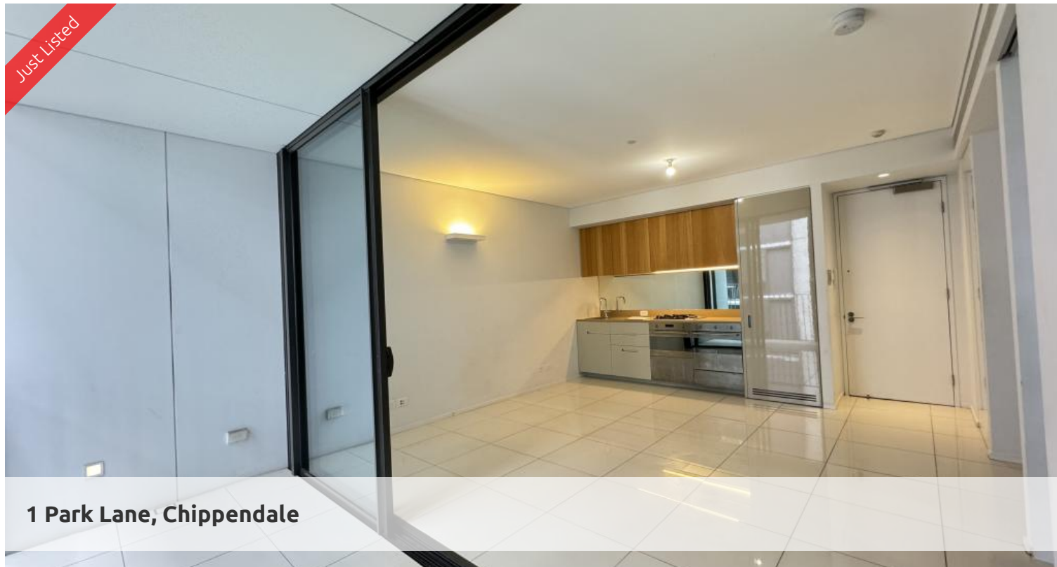
1 Park Lane, Chippendale