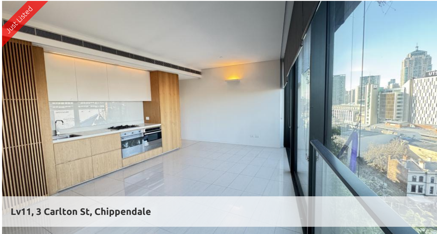
Lv11, 3 Carlton St, Chippendale