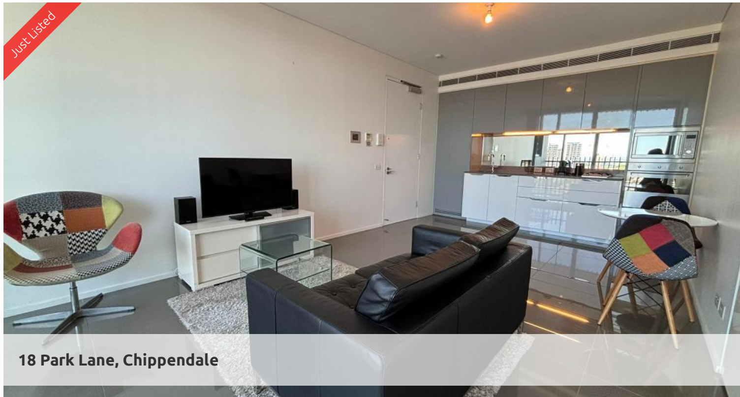
18 Park Lane, Chippendale