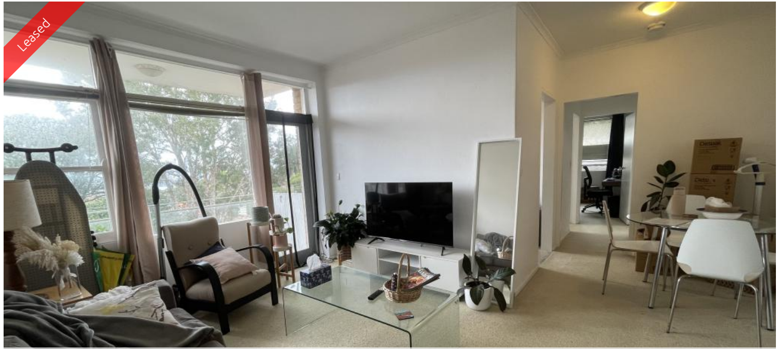
Unit 5/15 Reed St, Cremorne