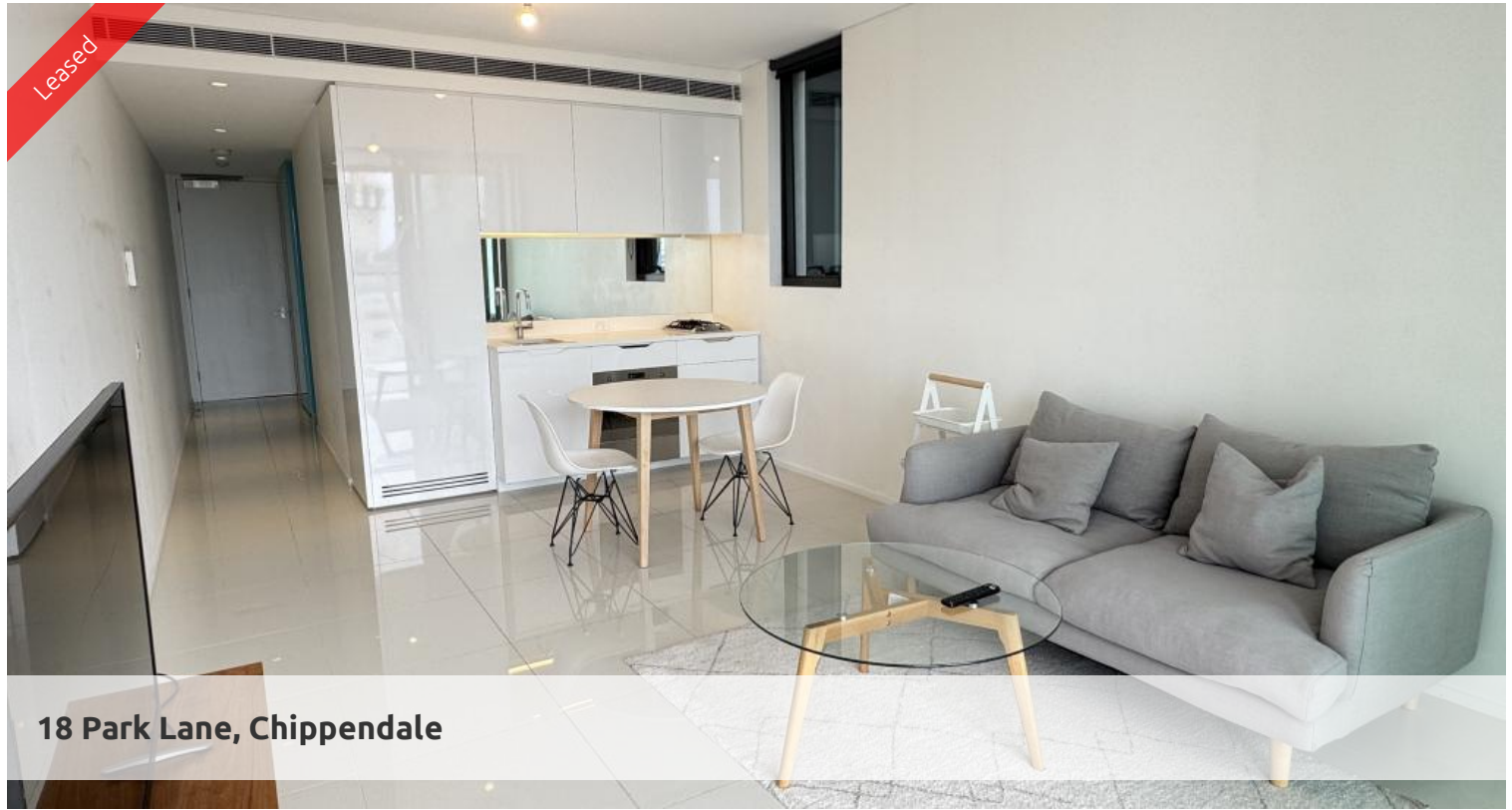
18 Park Lane, Chippendale