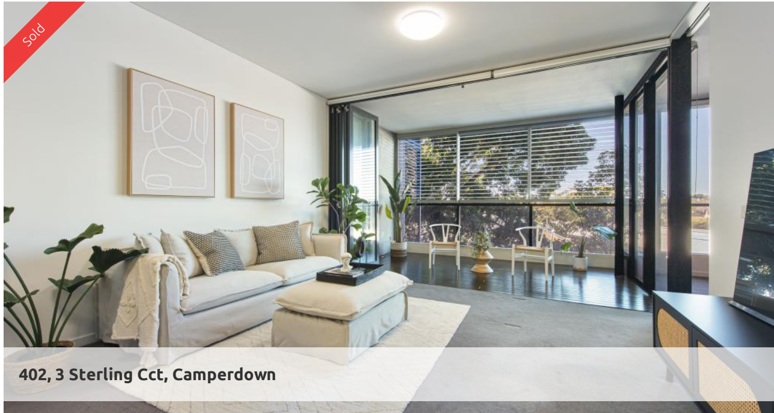
402, 3 Sterling Cct, Camperdown