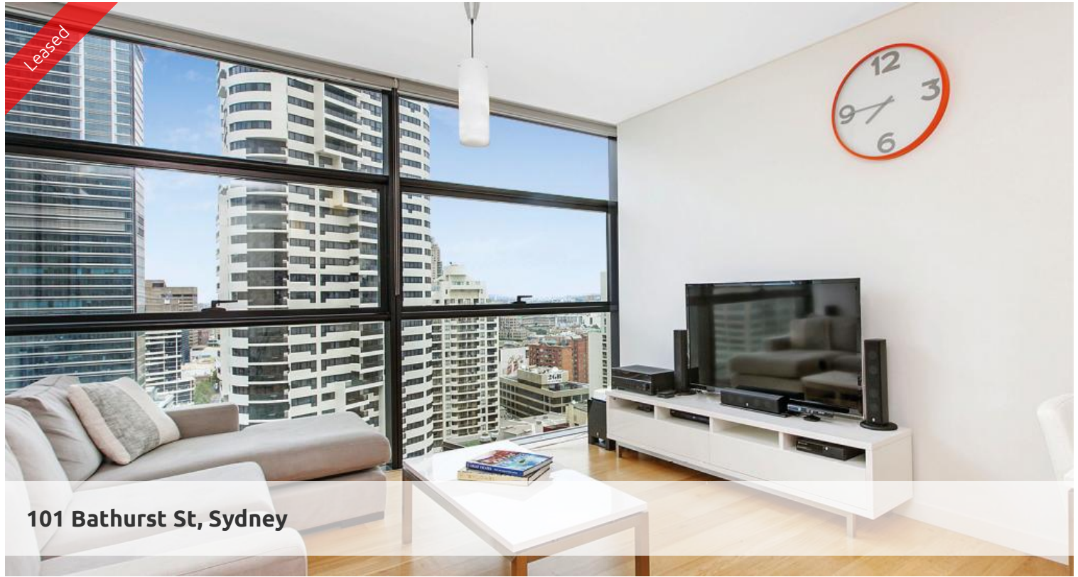
101 Bathurst St, Sydney