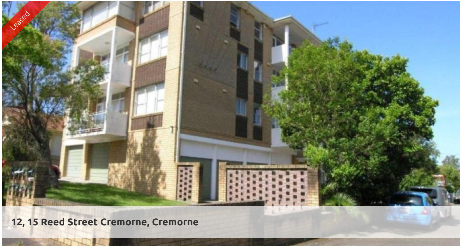
12, 15 Reed Street Cremorne, Cremorne