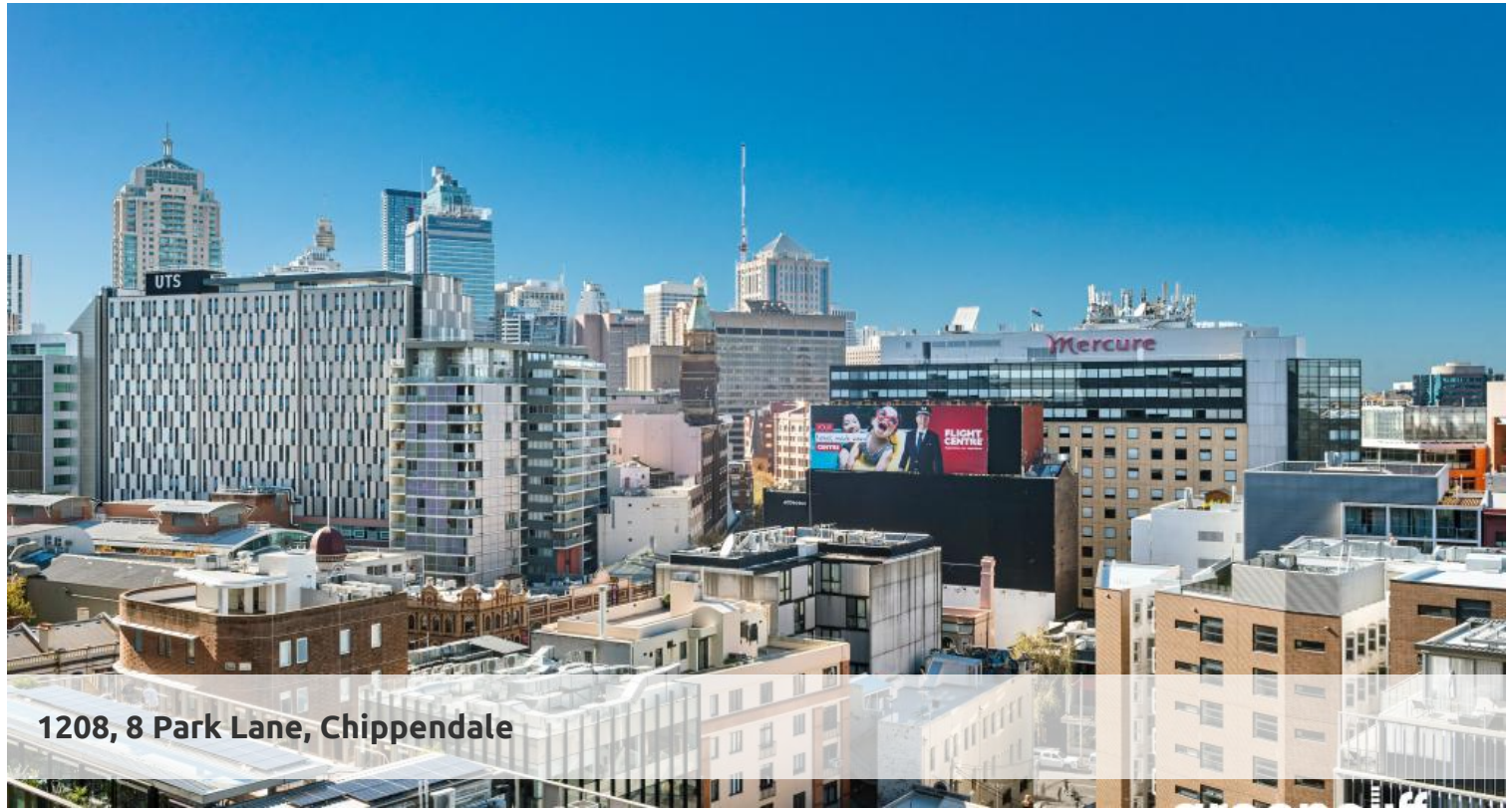
1208, 8 Park Lane, Chippendale