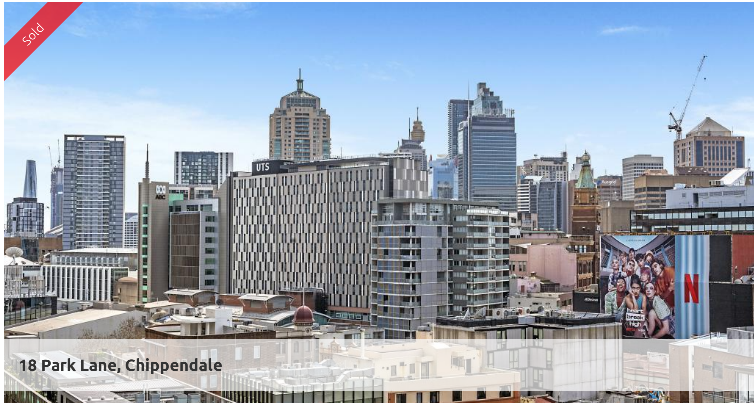
18 Park Lane, Chippendale