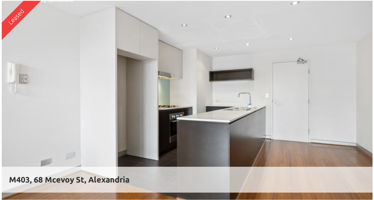
M403, 68 Mcevoy St, Alexandria