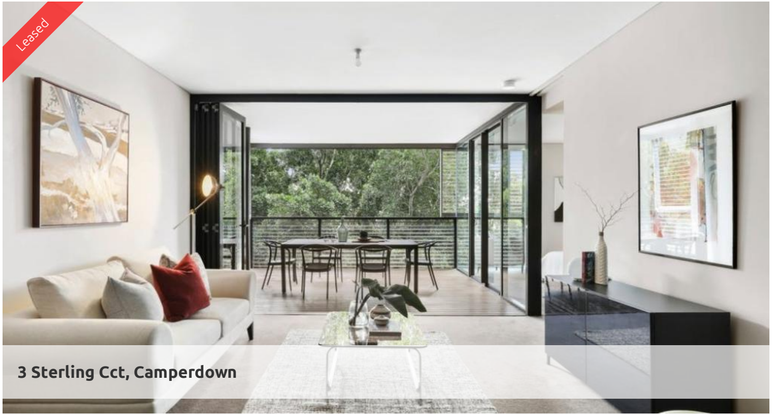
3 Sterling Cct, Camperdown