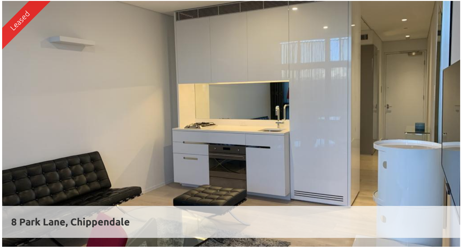
8 Park Lane, Chippendale