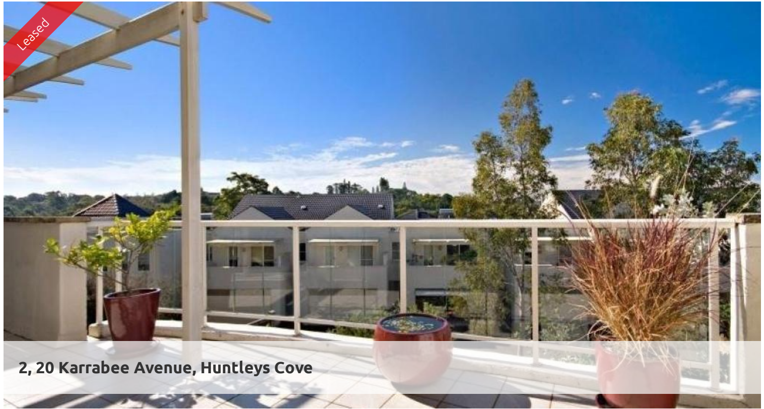
2, 20 Karrabee Avenue, Huntleys Cove