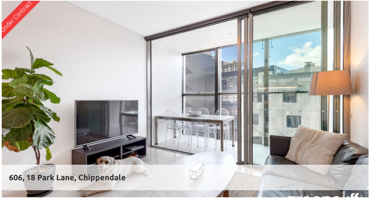
606, 18 Park Lane, Chippendale