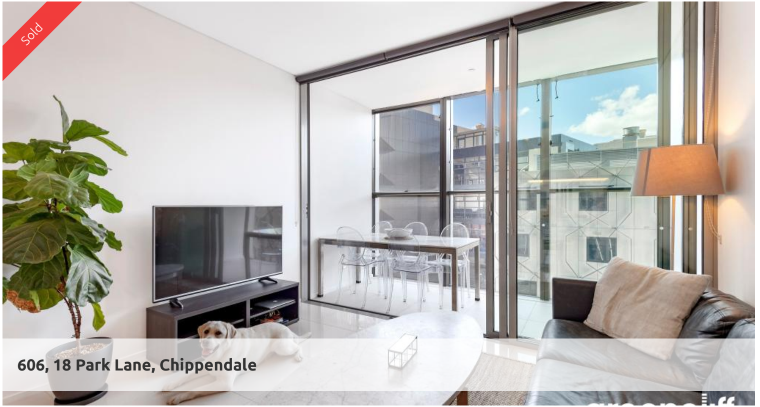
606, 18 Park Lane, Chippendale