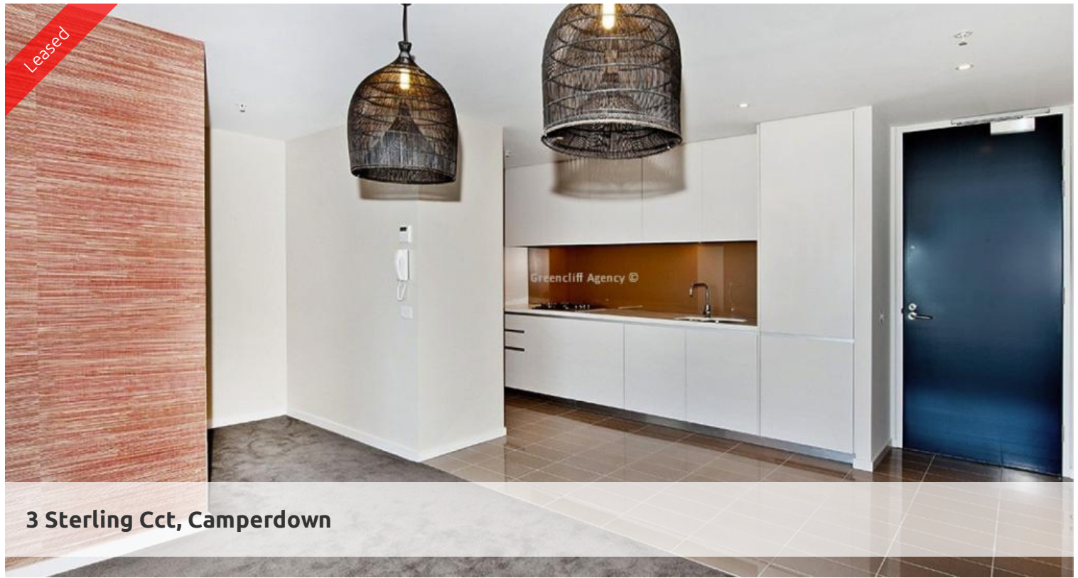
3 Sterling Cct, Camperdown