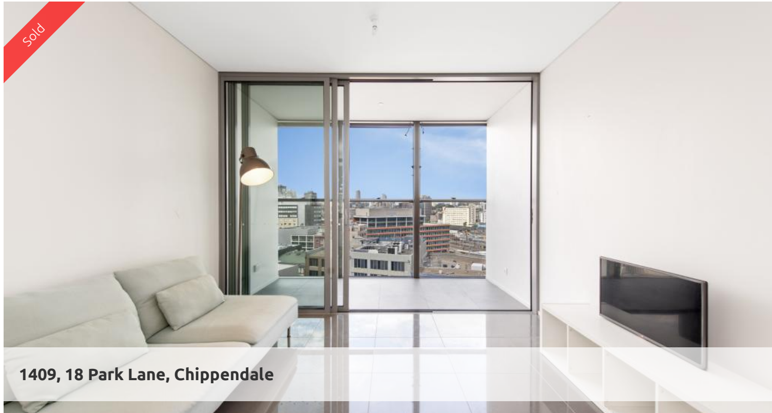
1409, 18 Park Lane, Chippendale