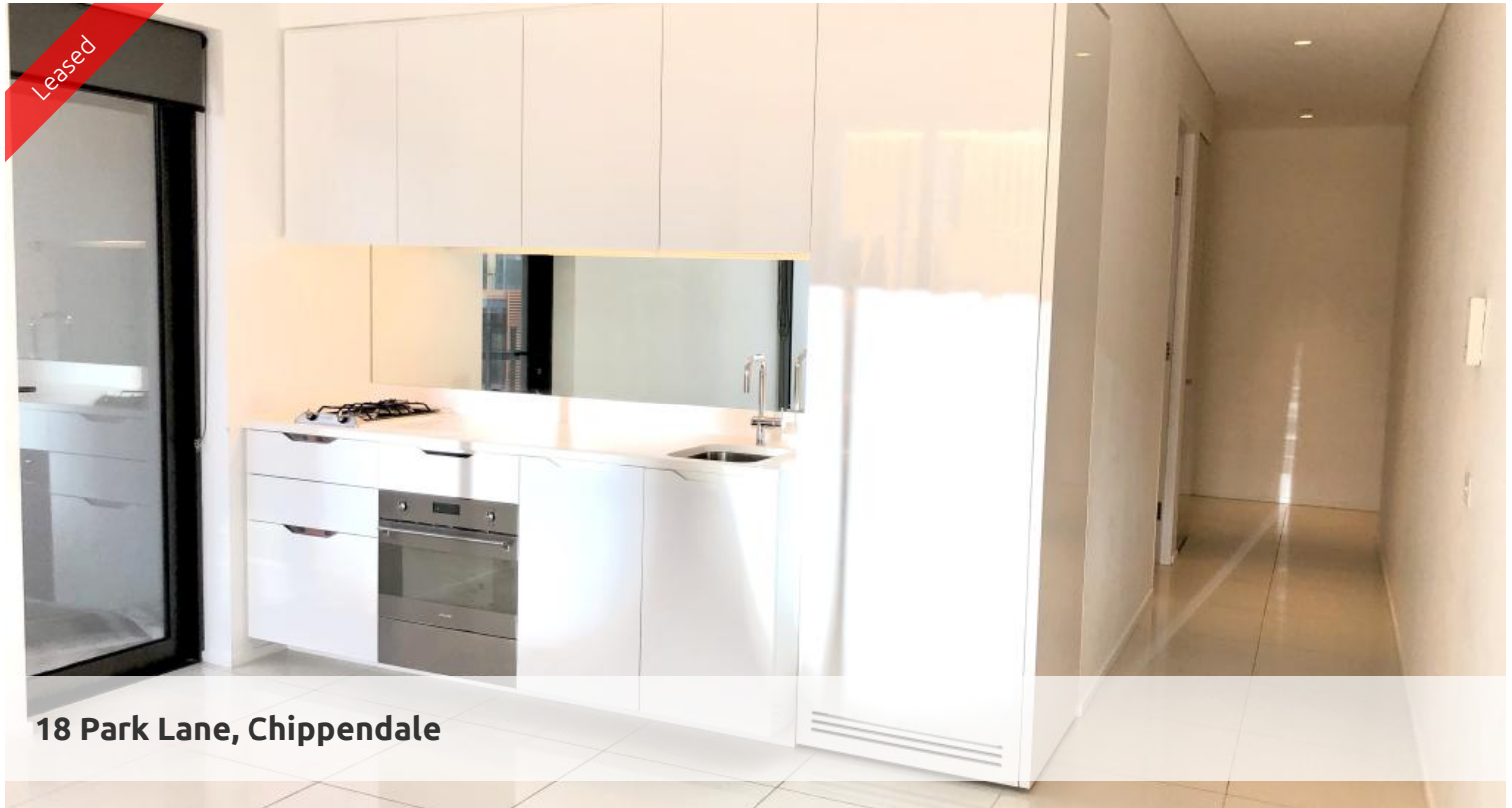
18 Park Lane, Chippendale