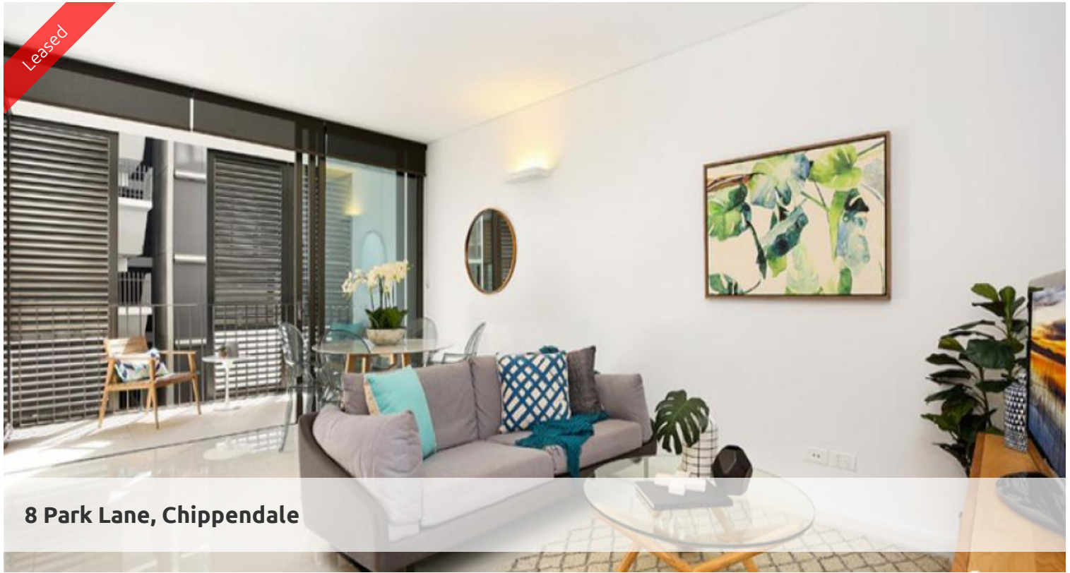
8 Park Lane, Chippendale