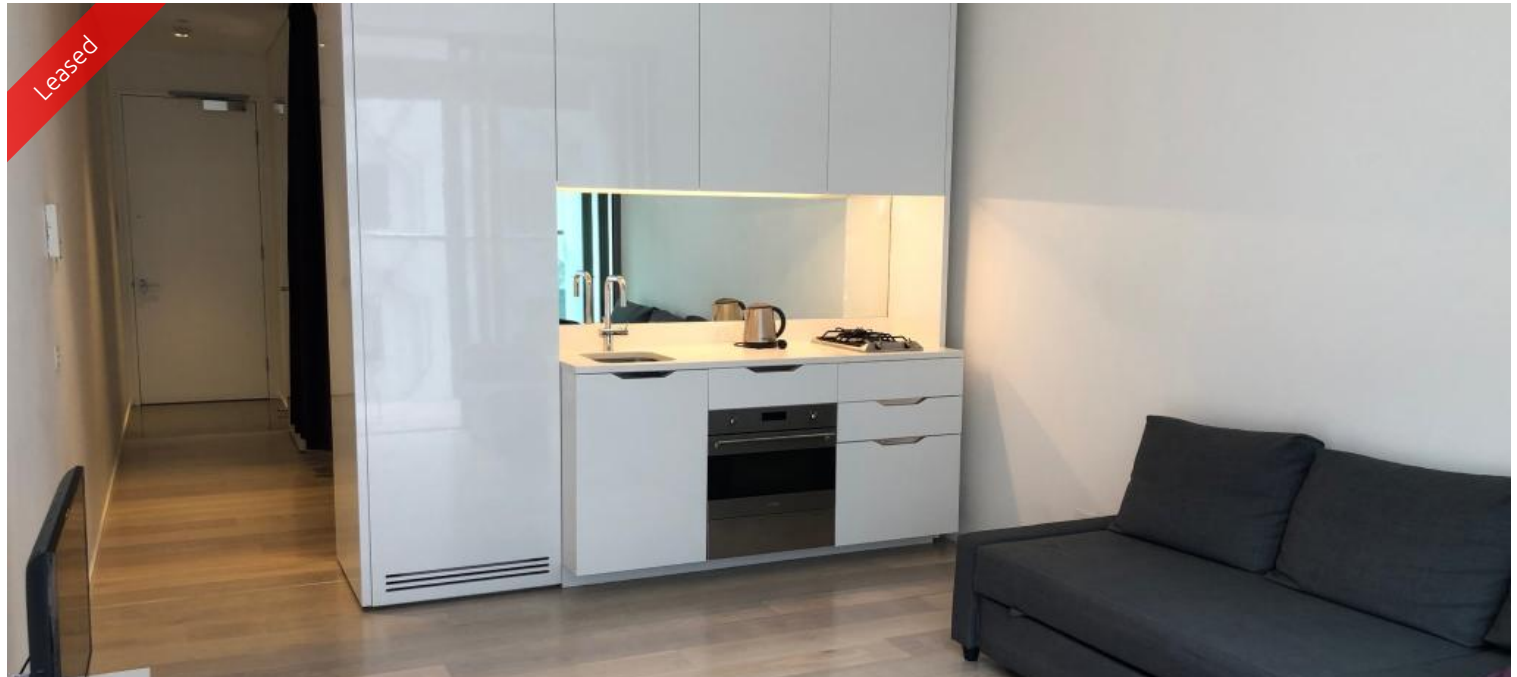
18 Park Lane, Chippendale