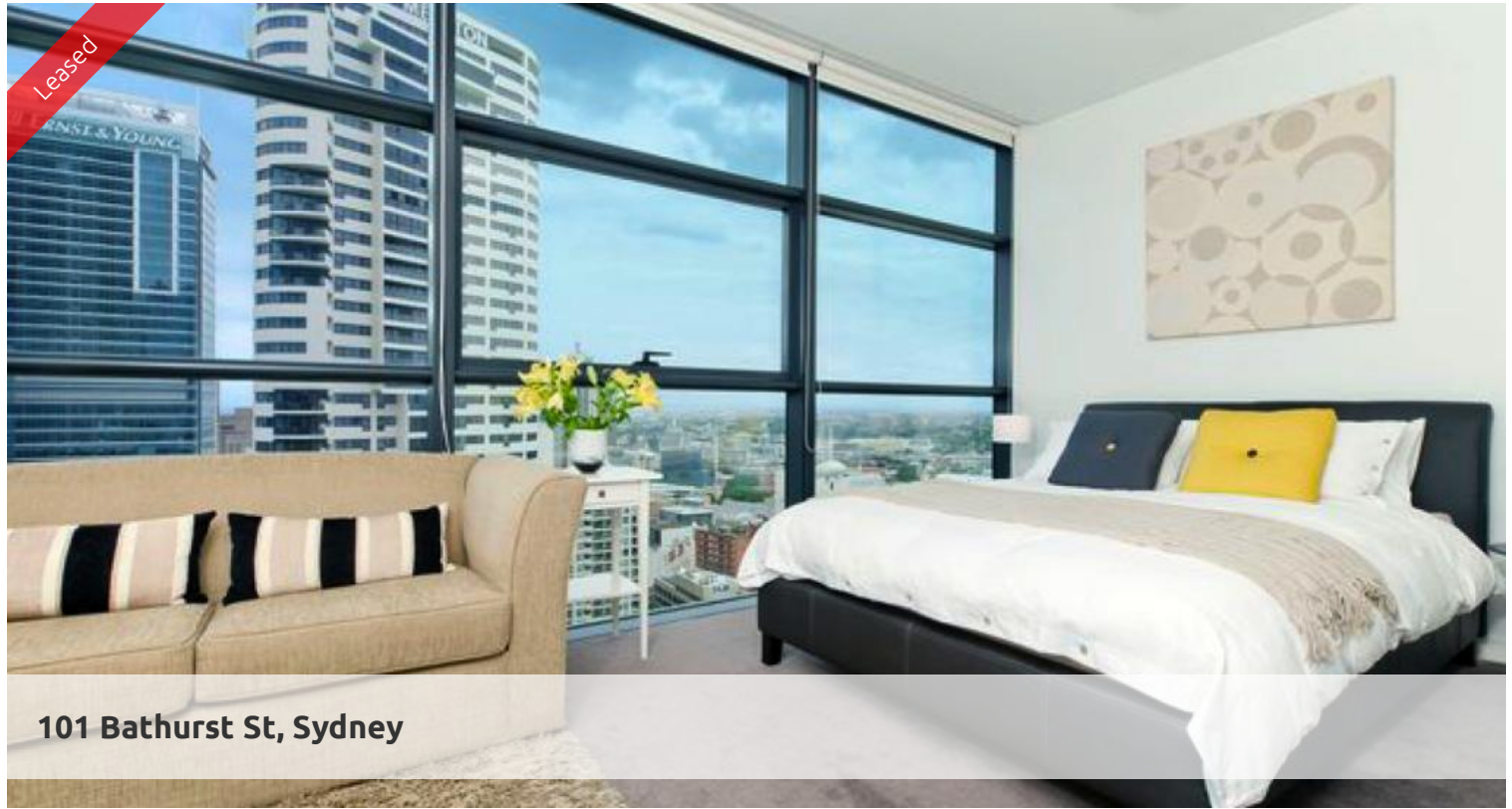
101 Bathurst St, Sydney