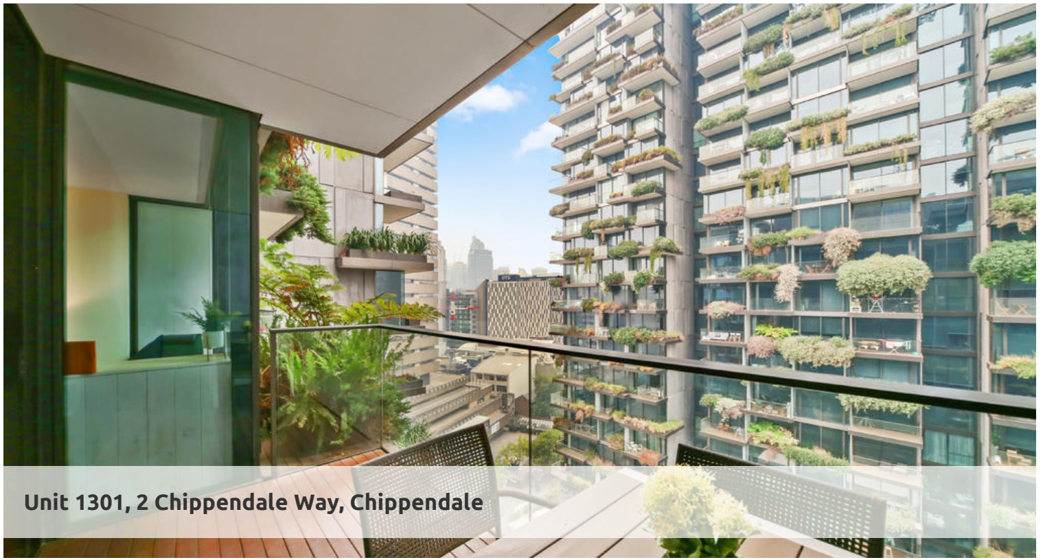
Unit 1301, 2 Chippendale Way, Chippendale