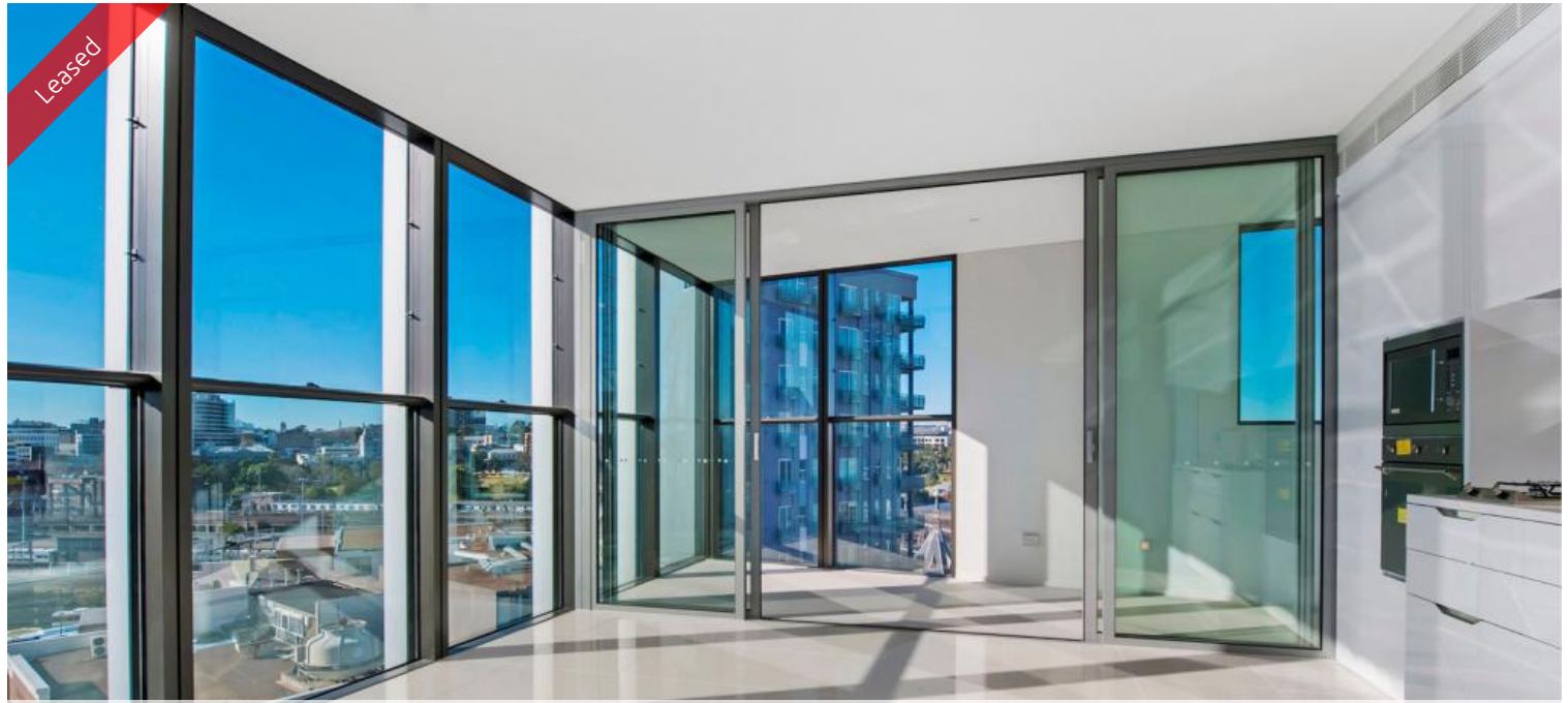
18 Park Lane, Chippendale