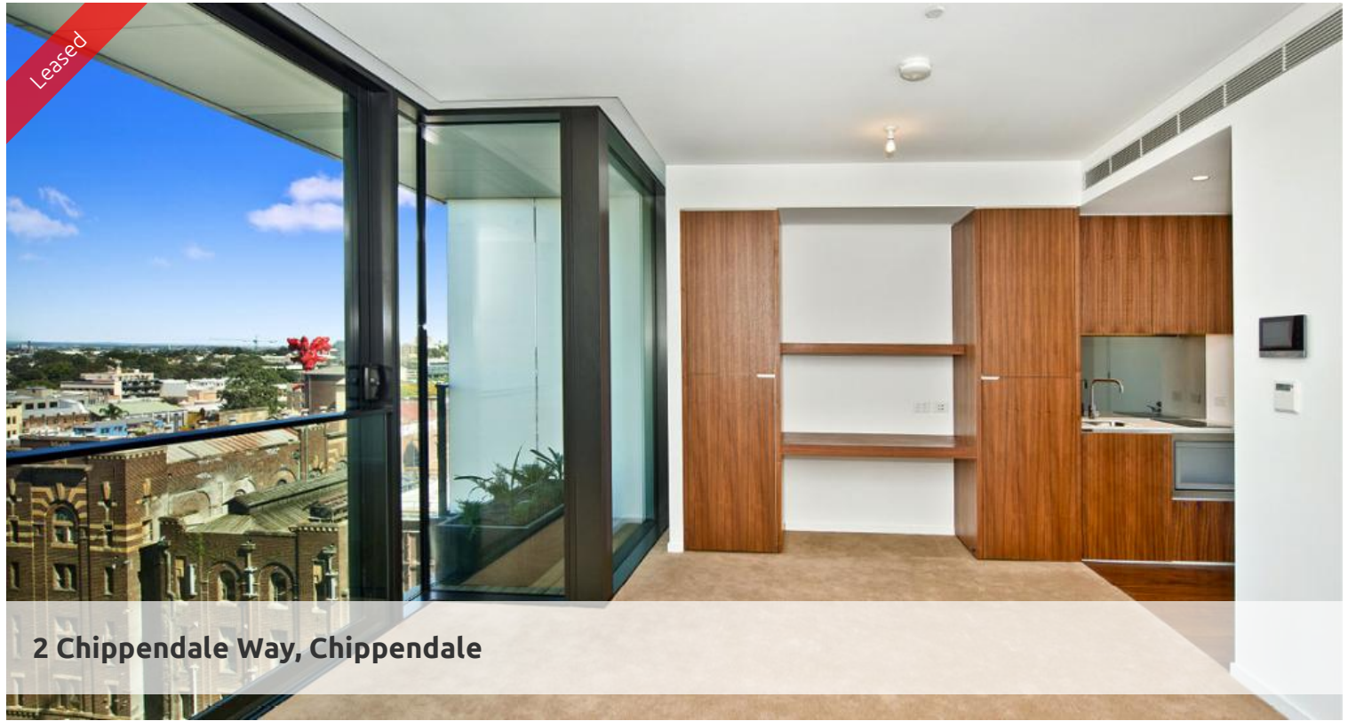
2 Chippendale Way, Chippendale