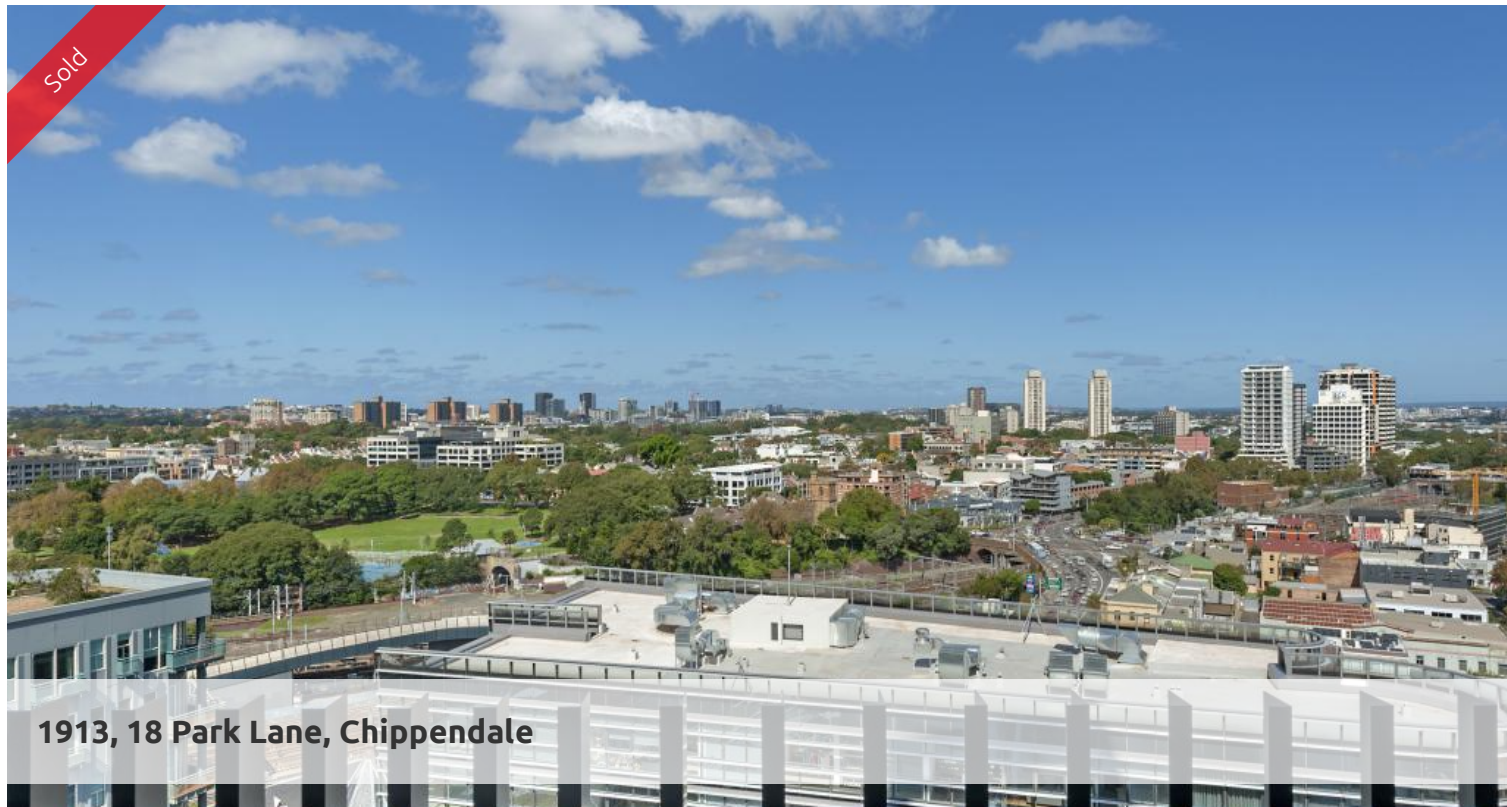
1913, 18 Park Lane, Chippendale