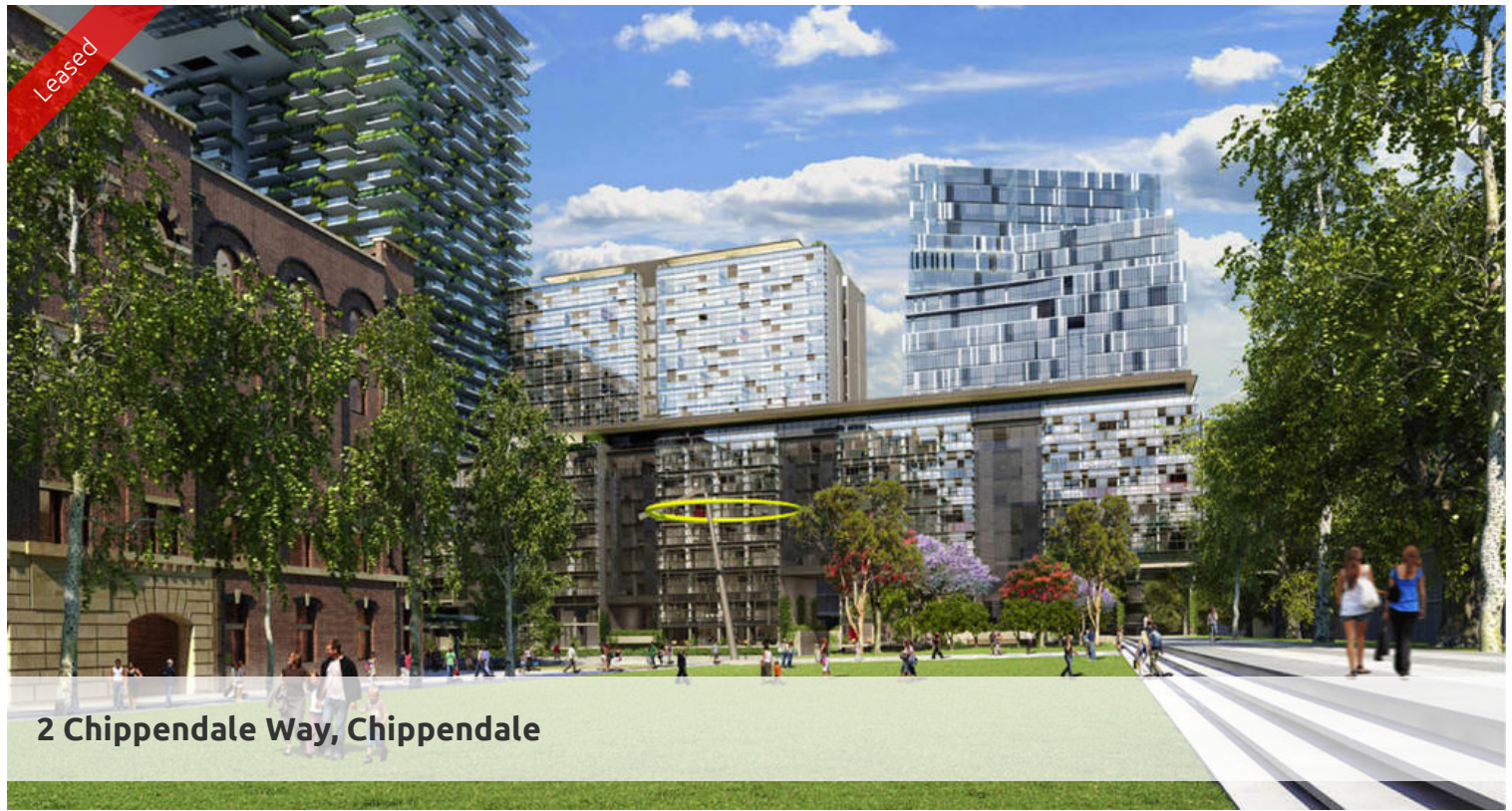
2 Chippendale Way, Chippendale