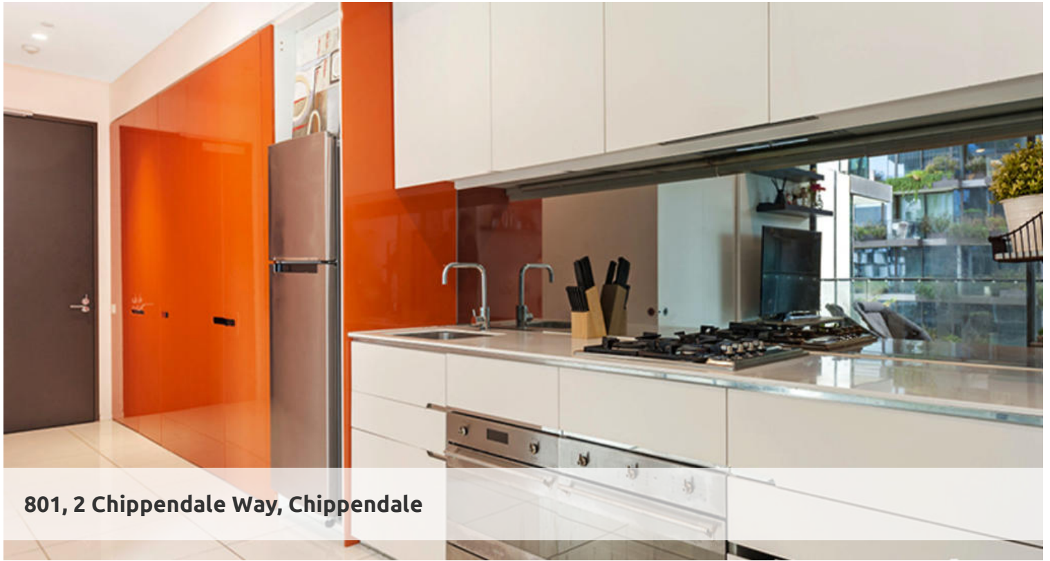
801, 2 Chippendale Way, Chippendale