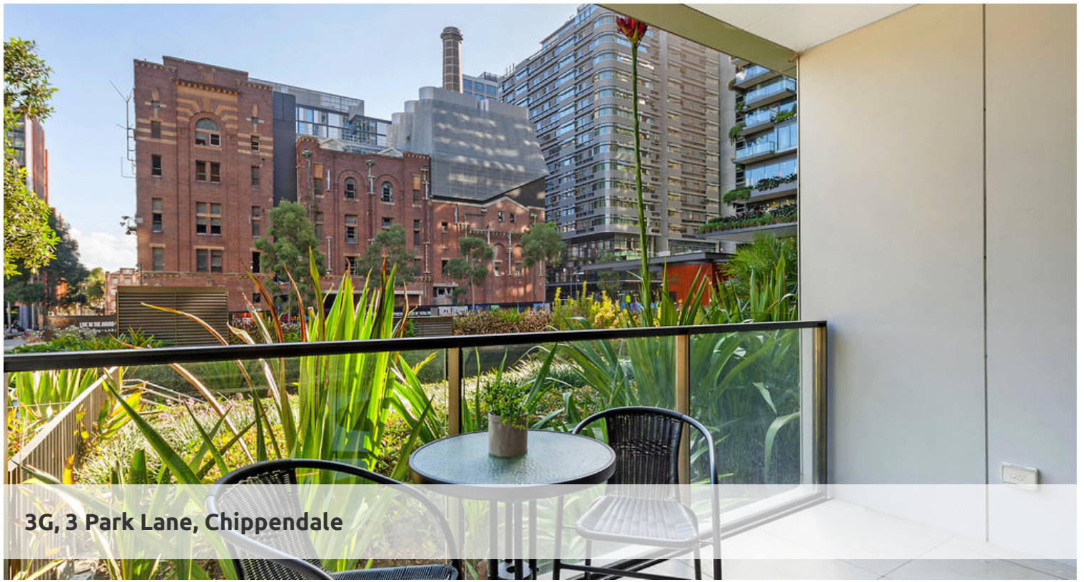
3G, 3 Park Lane, Chippendale