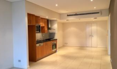
🔚 1 🔊 1 🖨 1