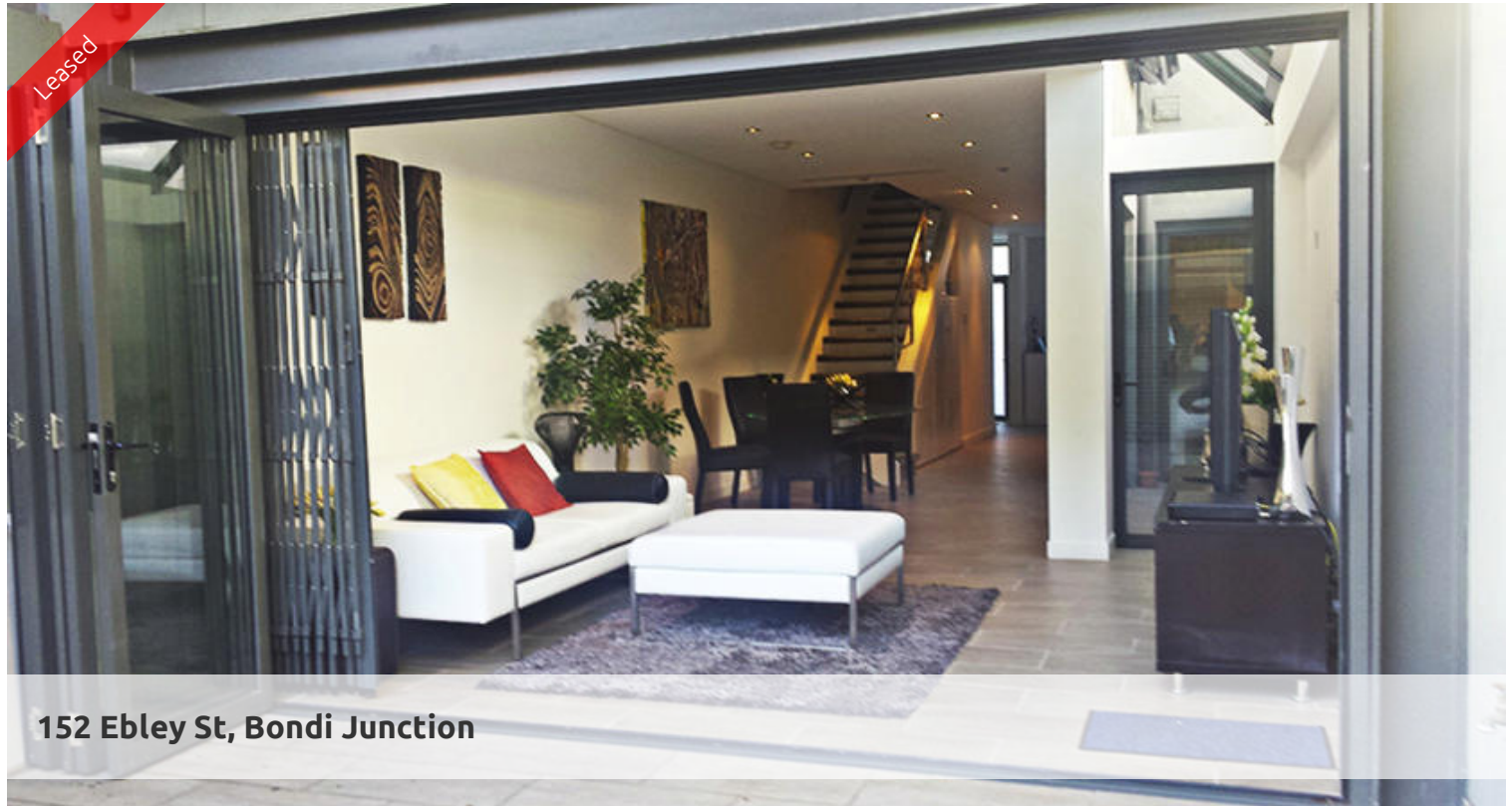
152 Ebley St, Bondi Junction