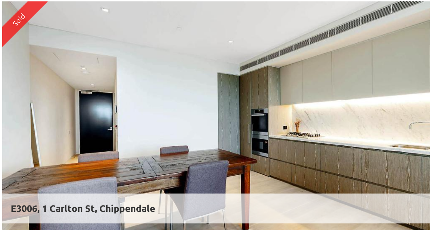
E3006, 1 Carlton St, Chippendale