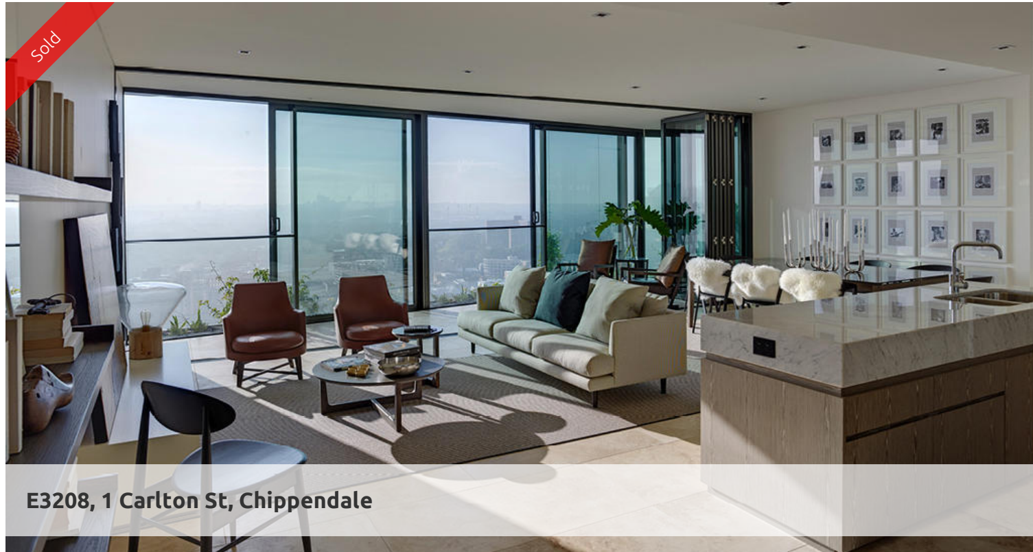
E3208, 1 Carlton St, Chippendale