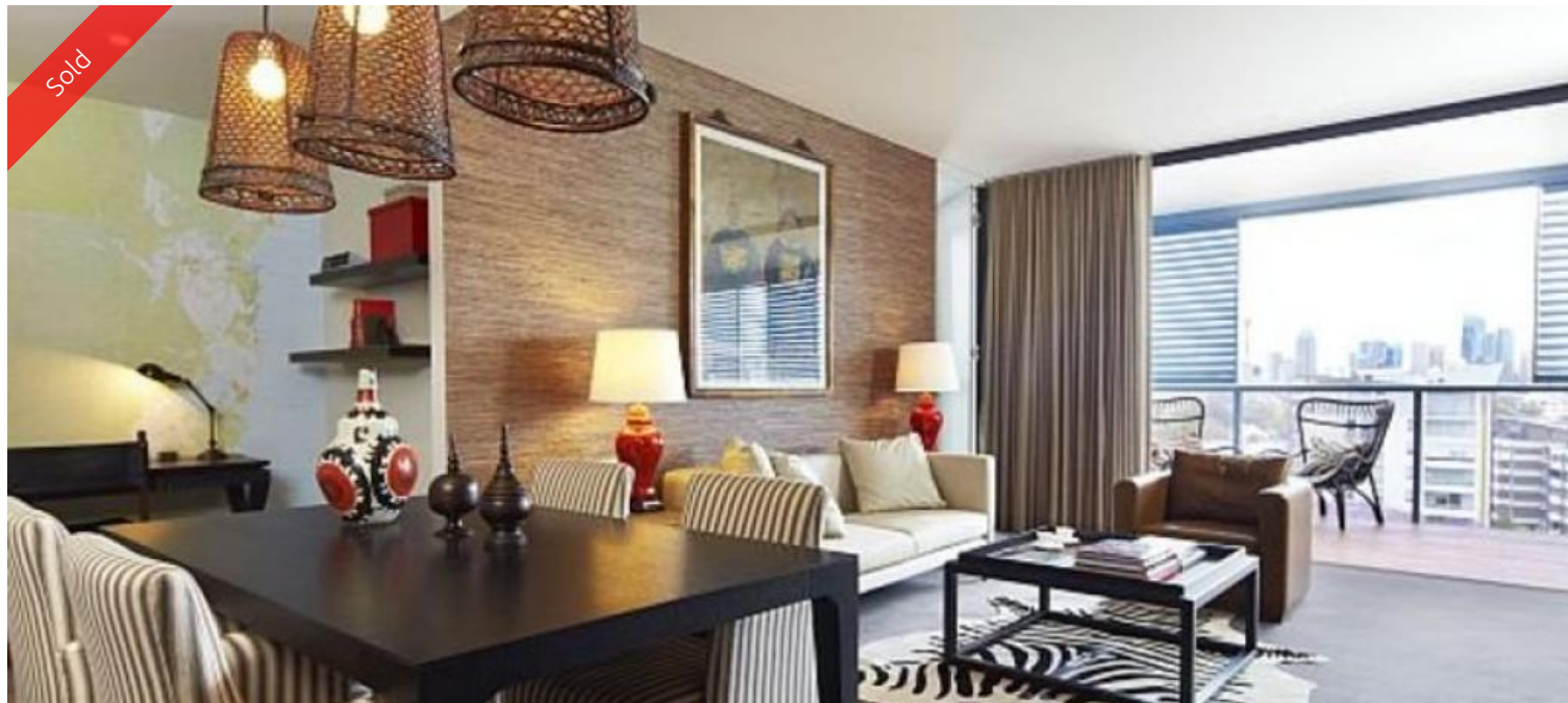
C1004, 3 Sterling Circuit, Camperdown