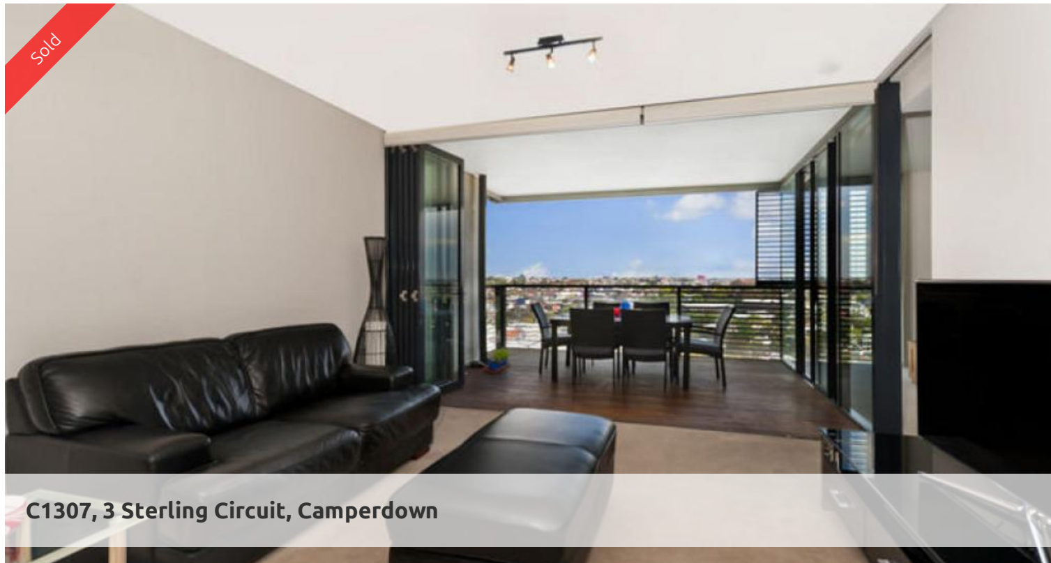
C1307, 3 Sterling Circuit, Camperdown