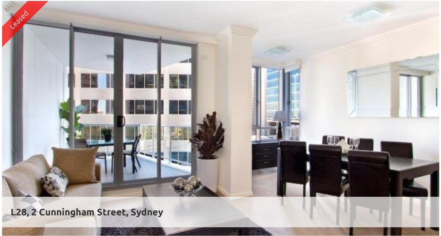
L28, 2 Cunningham Street, Sydney