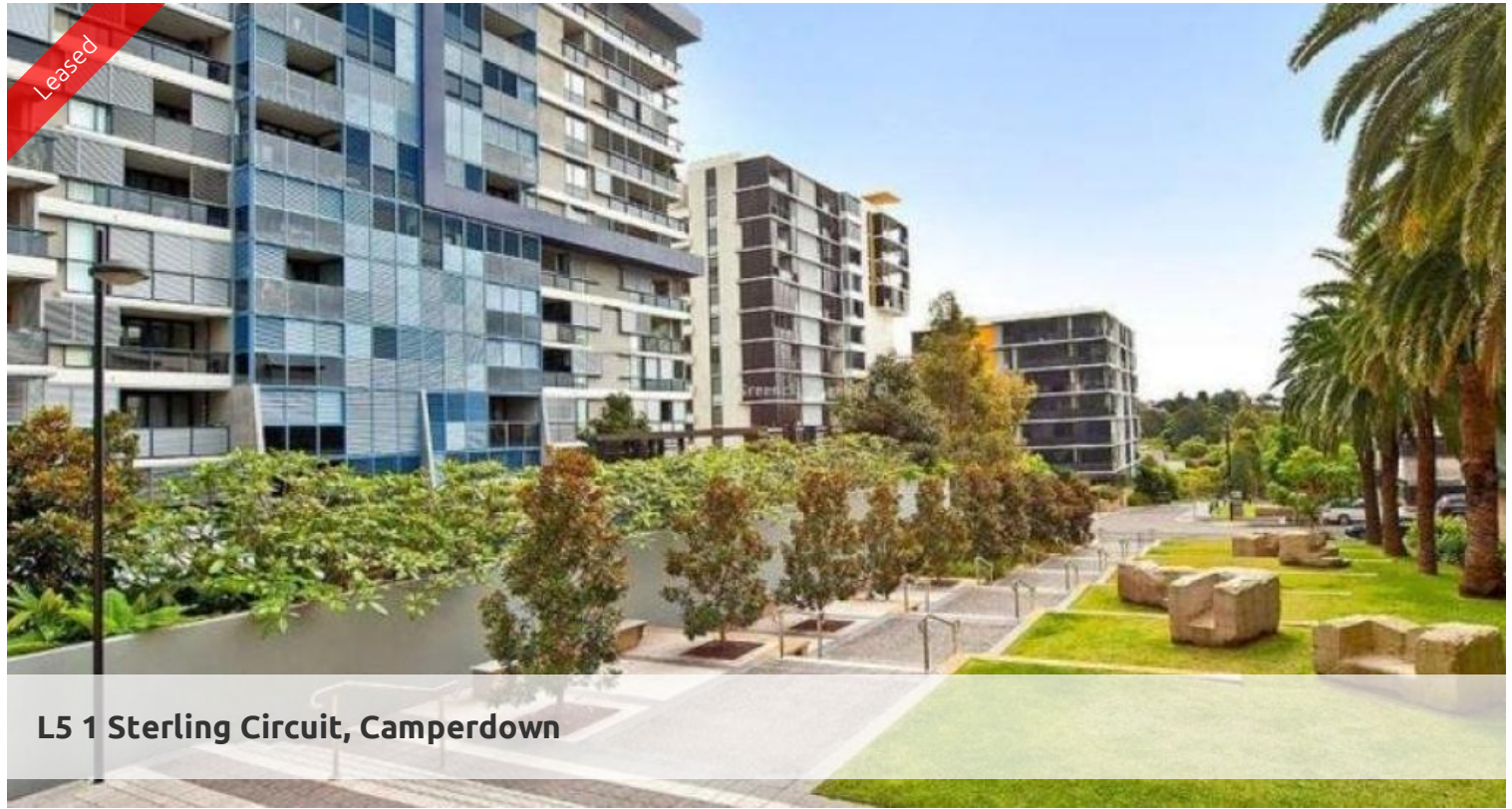
L5 1 Sterling Circuit, Camperdown