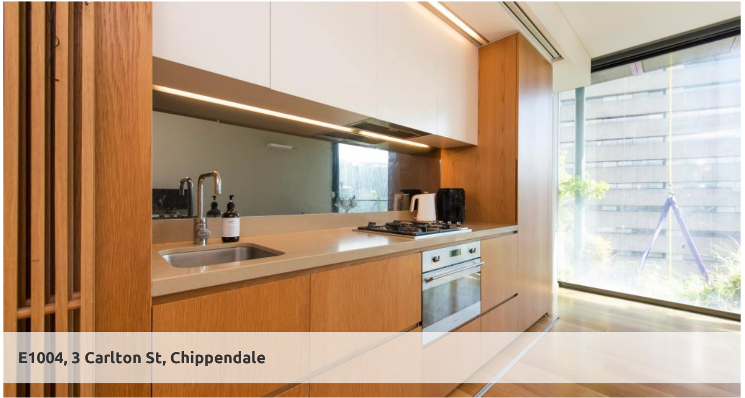
E1004, 3 Carlton St, Chippendale