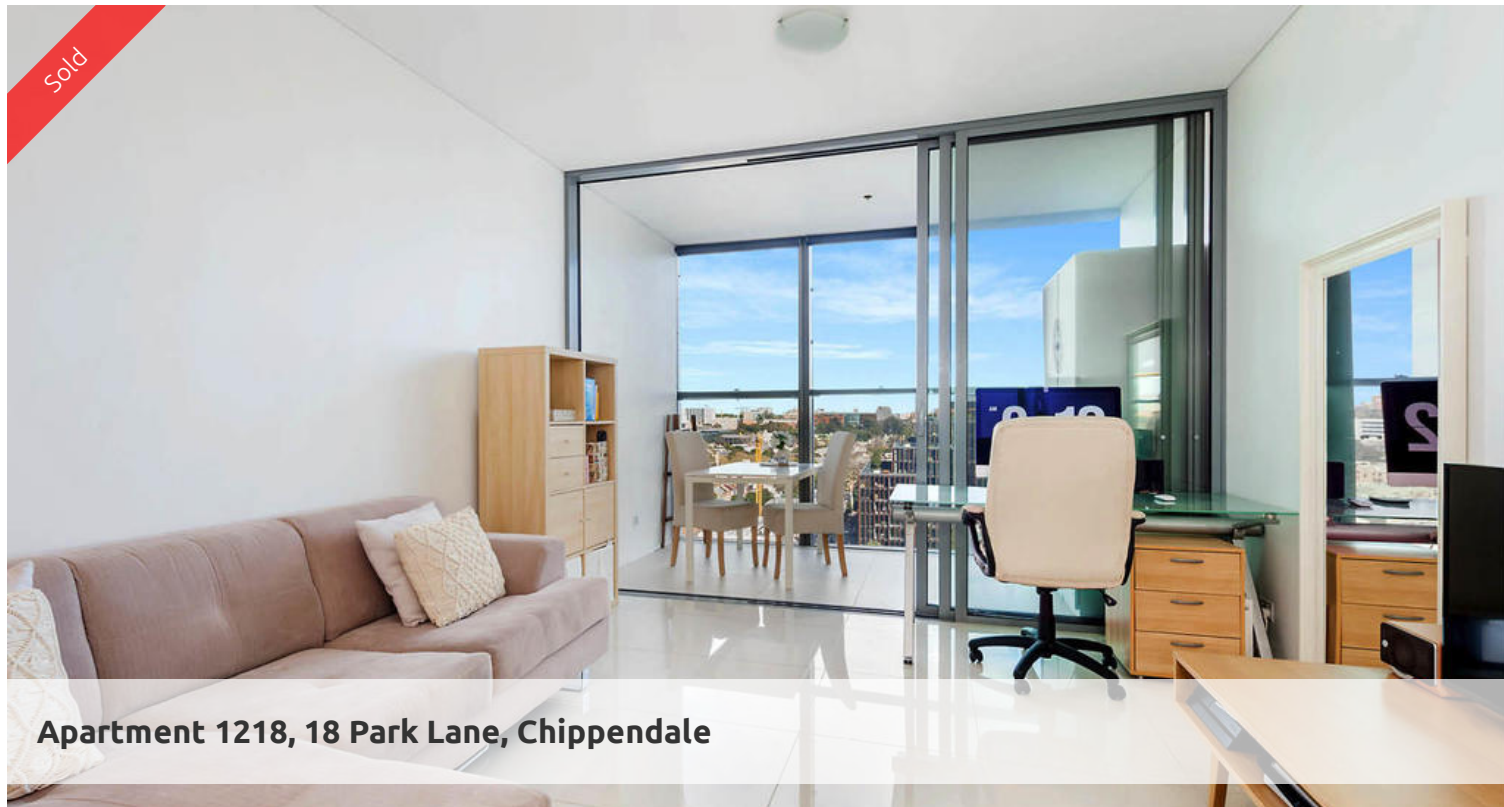
Apartment 1218, 18 Park Lane, Chippendale