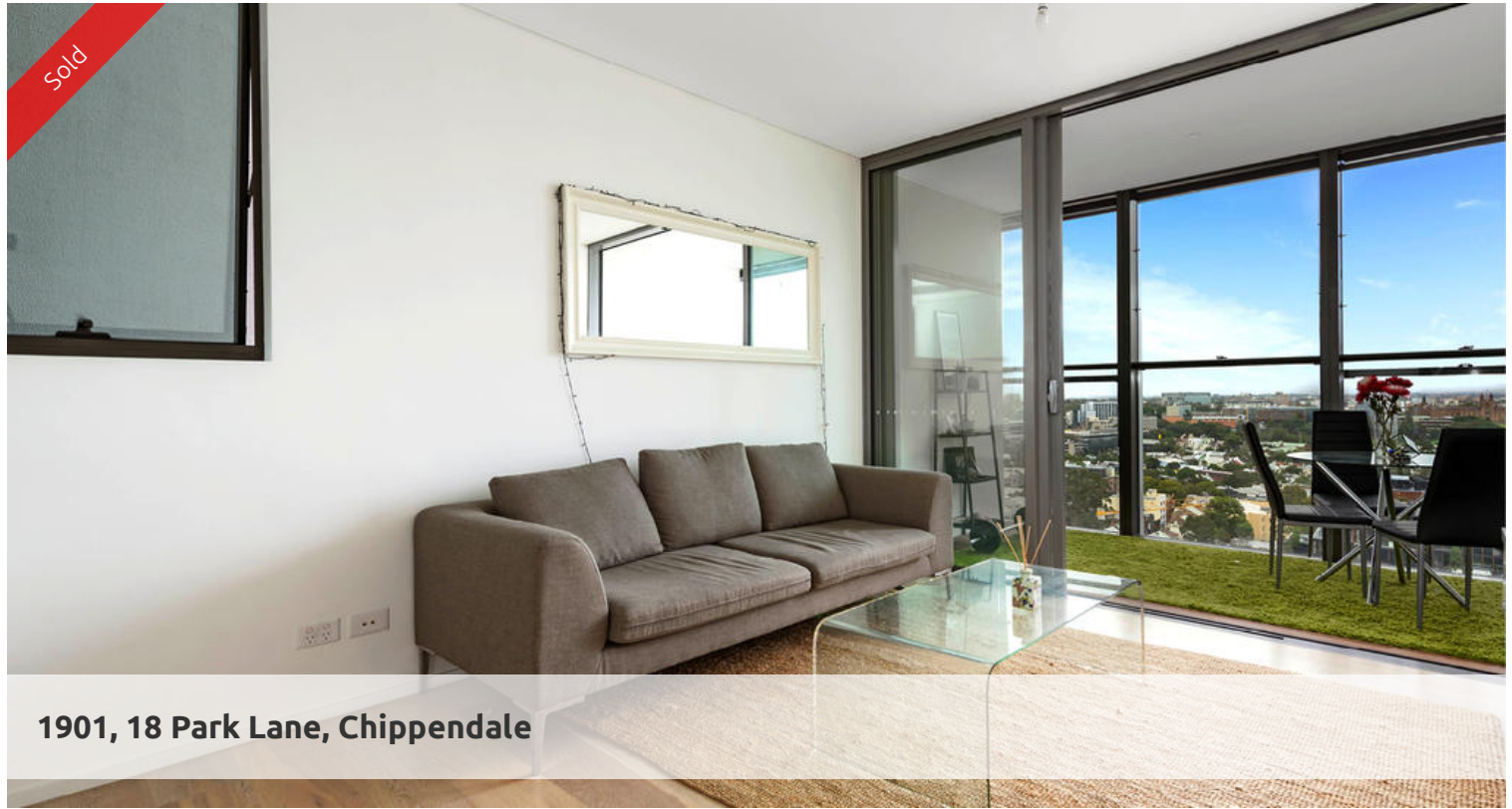
1901, 18 Park Lane, Chippendale