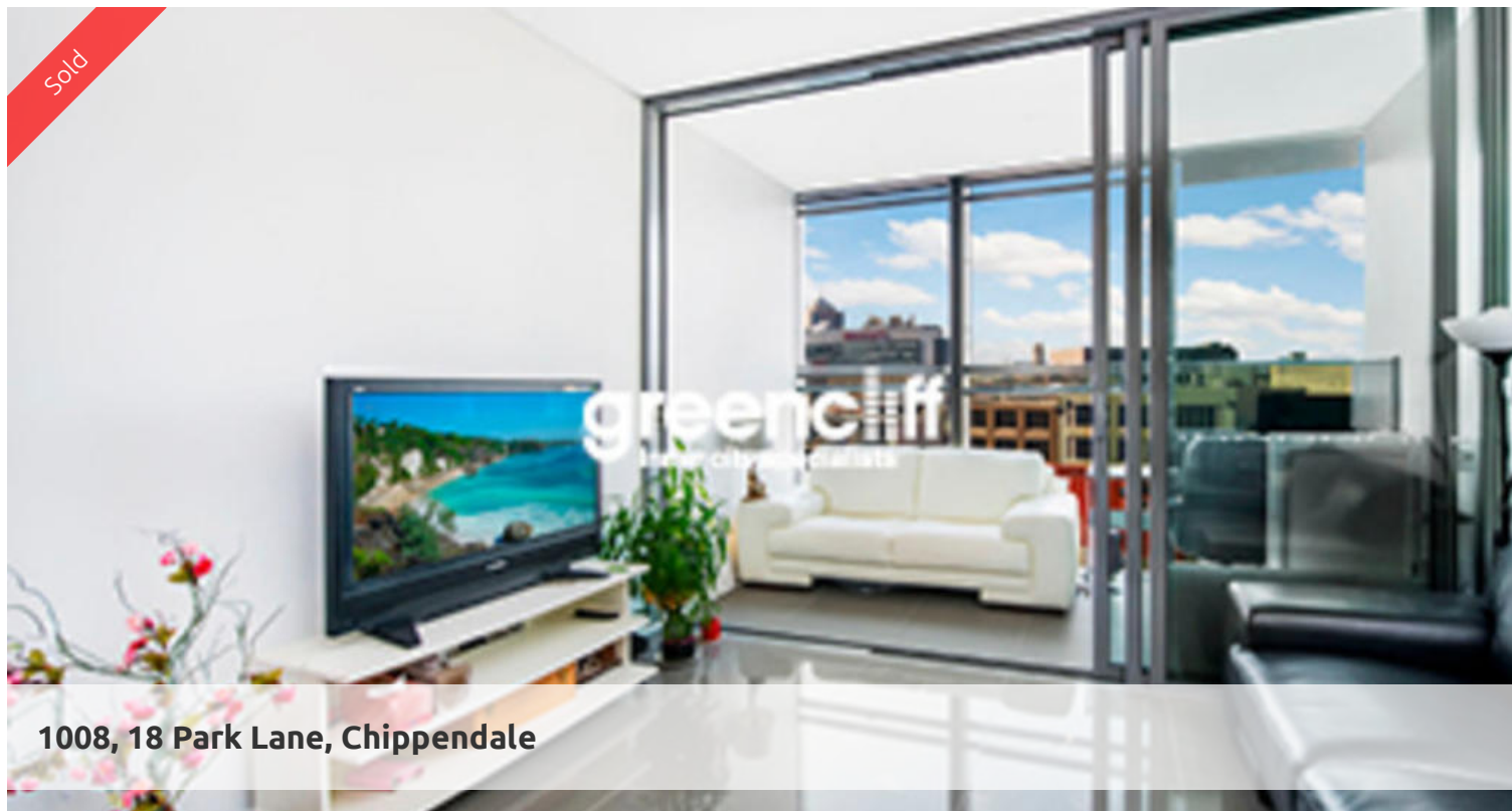
1008, 18 Park Lane, Chippendale