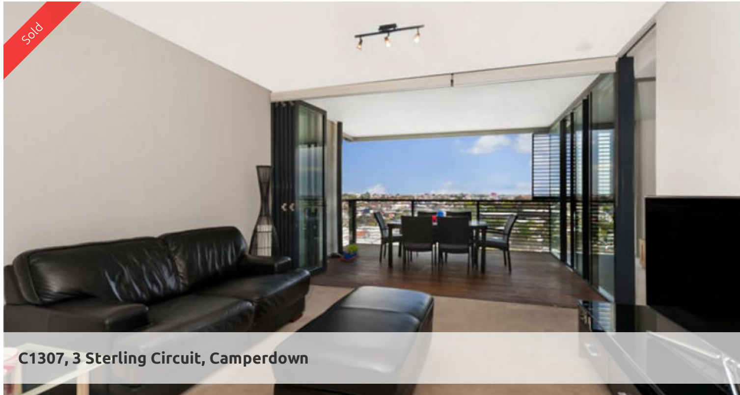
C1307, 3 Sterling Circuit, Camperdown