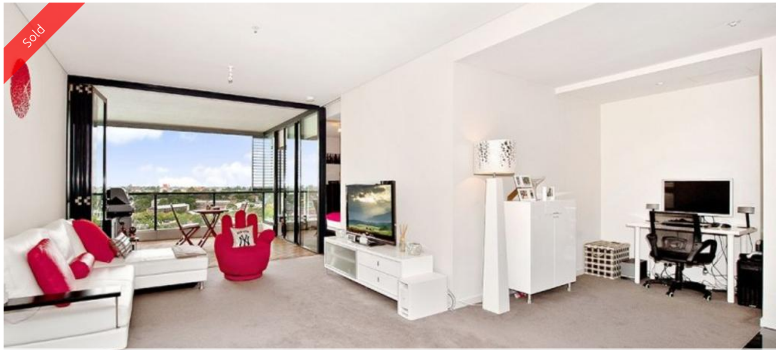
C1207, 3 Sterling Circuit, Camperdown