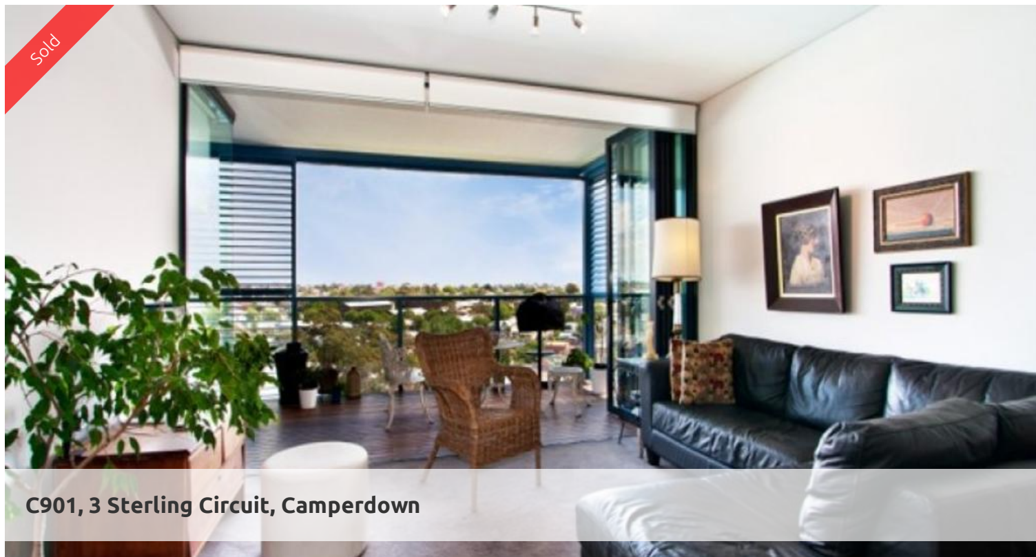
C901, 3 Sterling Circuit, Camperdown