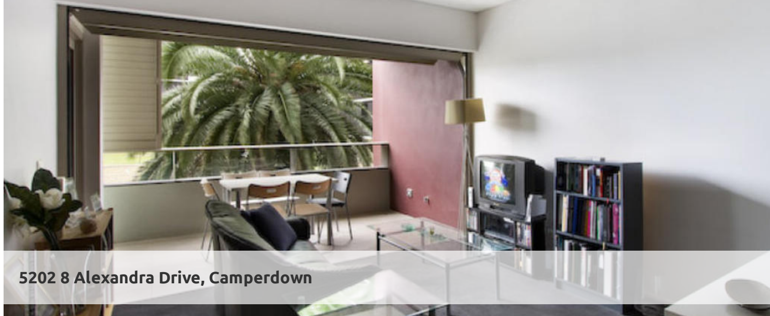
5202 8 Alexandra Drive, Camperdown